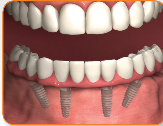
denture is attached to the implants to function like natural teeth